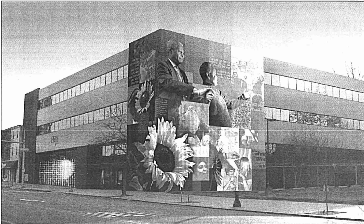
New Mural covers 3600 square feet of the Elwyn Philadelphia site at 4040 Market Street. It features strong imagery, vibrant colors and powerful words that all have real-life inspirations.